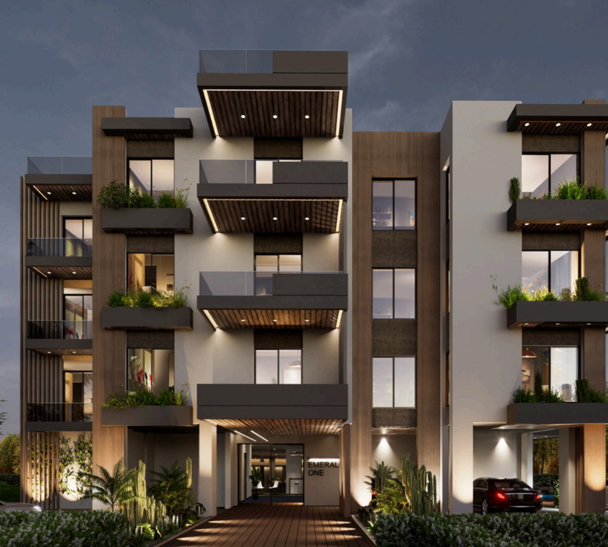
Facade Wide View