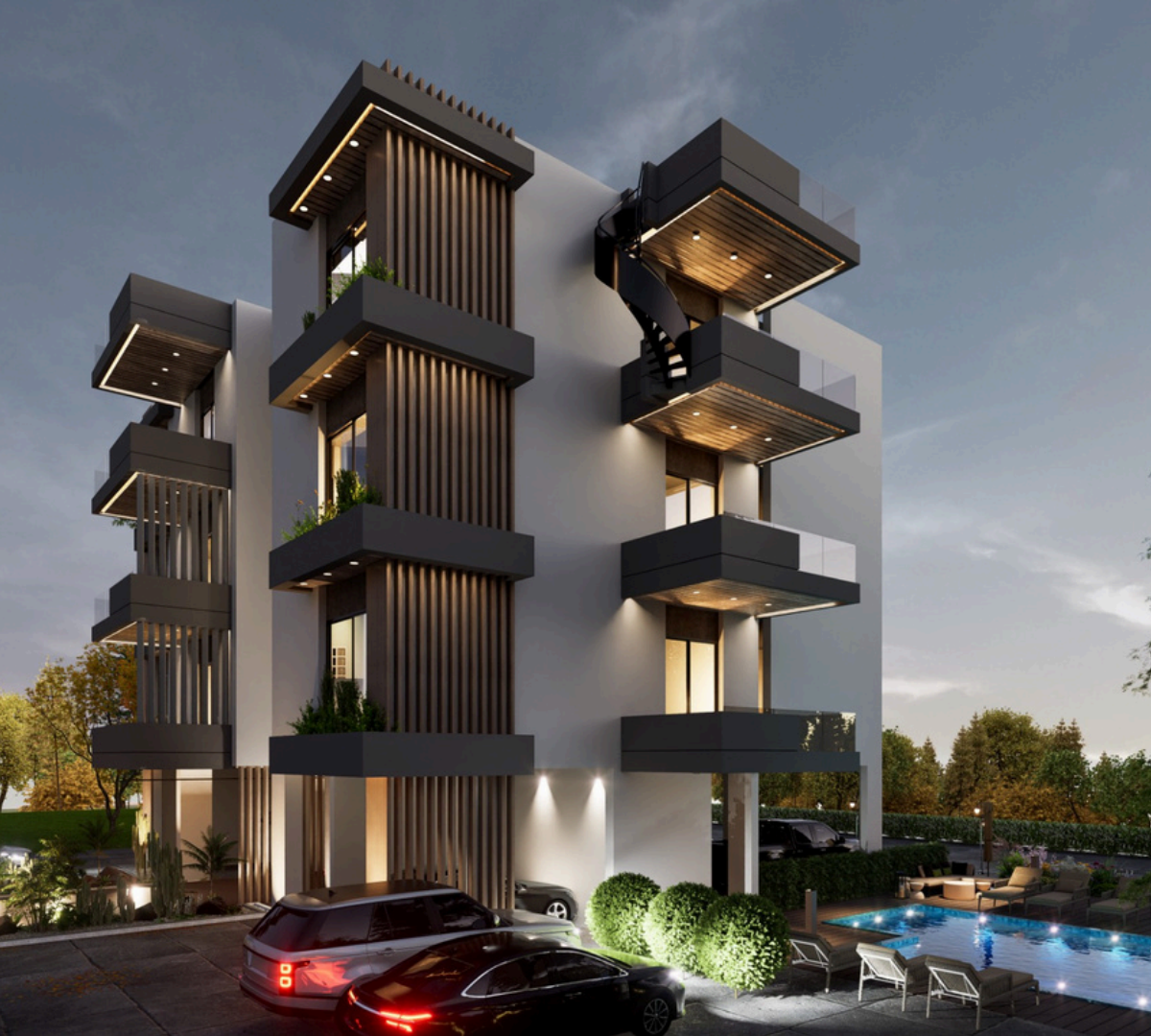
Facade / Pool View