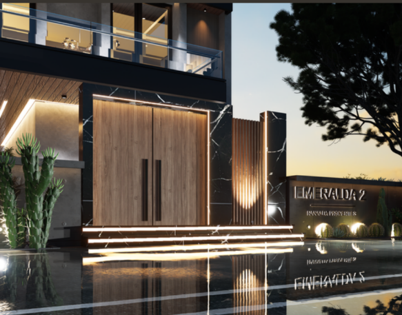
Main Entrance View