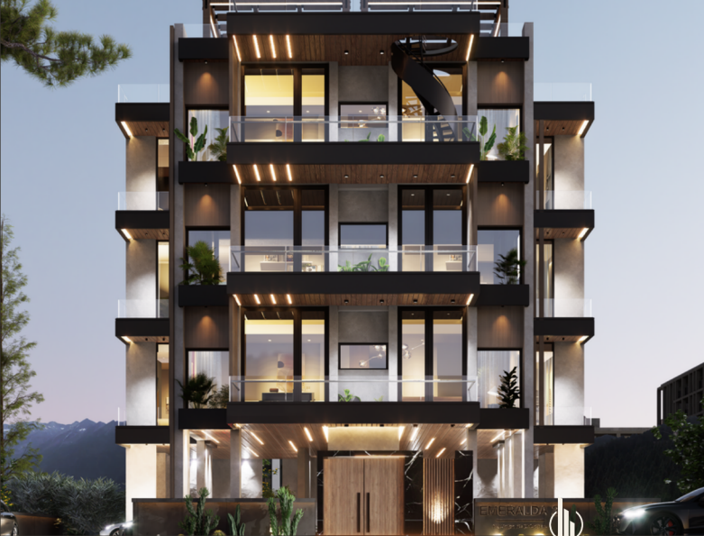
Facade Wide View