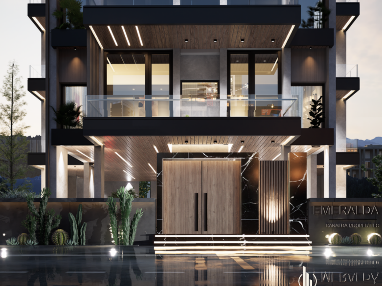
Main Facade Entrance