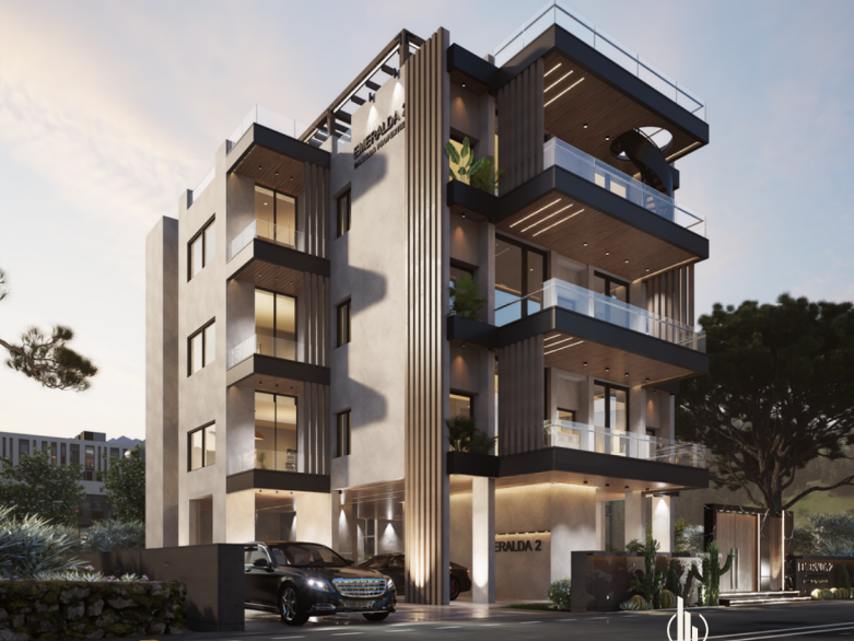
Facade / Side View