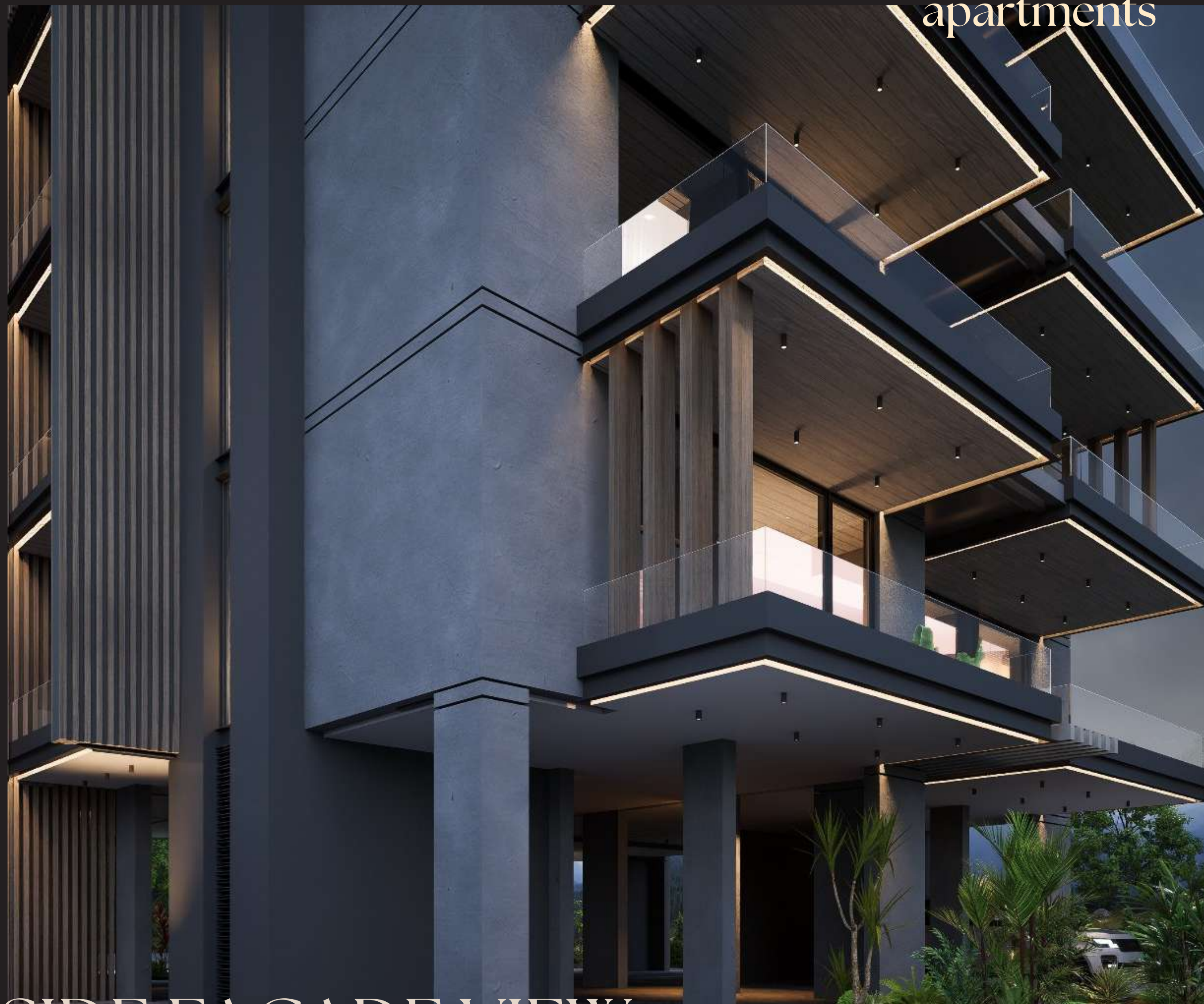
SIDE FACADE VIEW