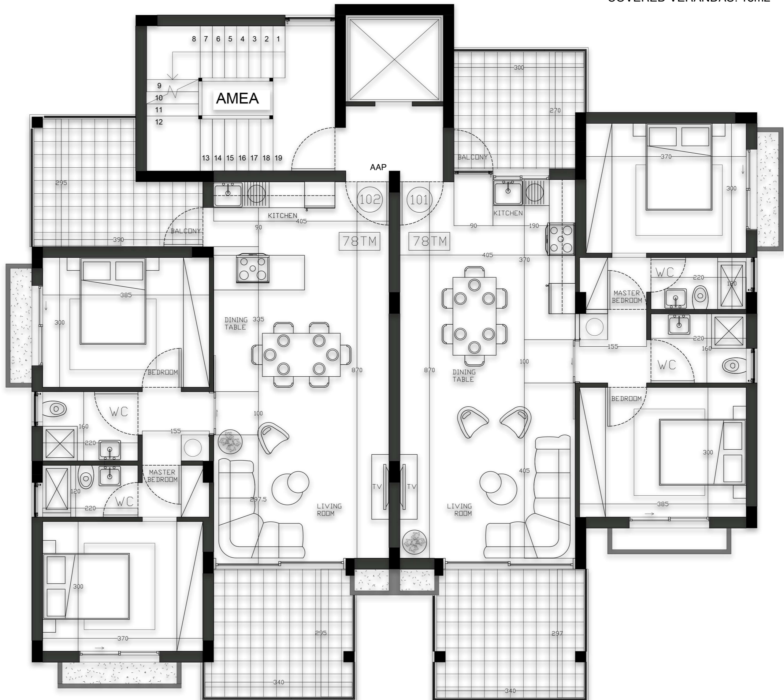
Emeralda Four – First Floor Plan With Dimensions

APARTMENT NUMBER 101 - TWO BDR INTERNAL AREA: 78m 2 COVERED VERANDAS: 18m 2